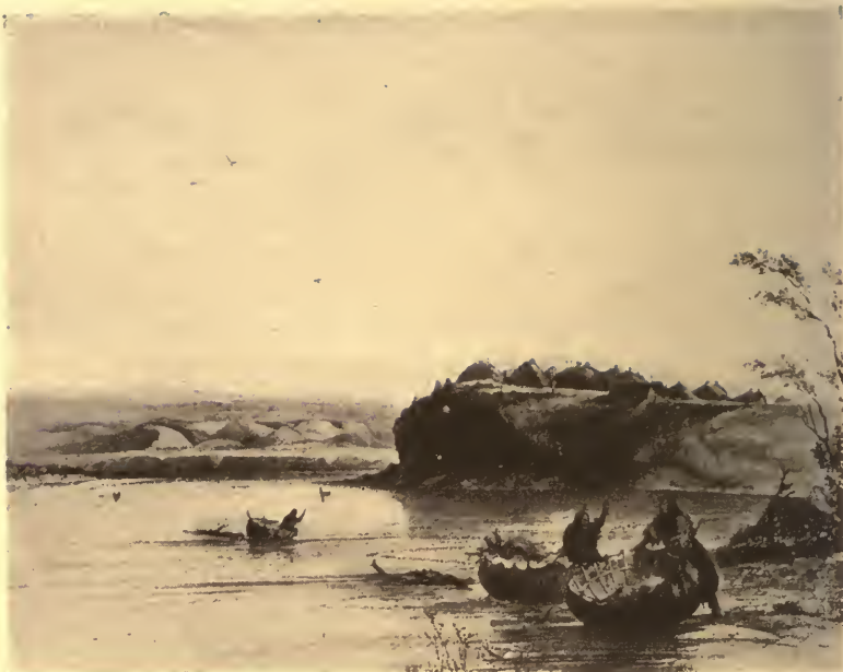
Reproduced from Maximilian, Prince of Wied Indian Bull-Boat