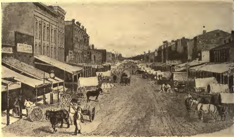
The Broadway, St. Louis, 1853

has acquired the manners and adapted herself to the usages of the white race with singular facility. Their children have been sent to the States to be educated in our best schools.